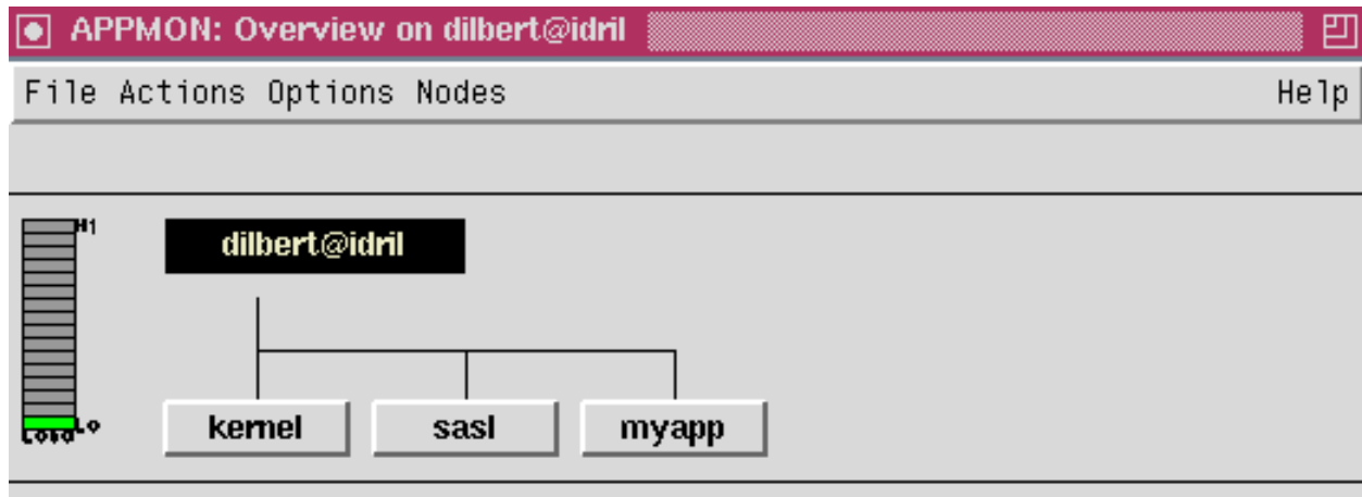
Figure 1.1: The Main Window.

The load meter shows load measured as processor time, or as the length of the ready queue.