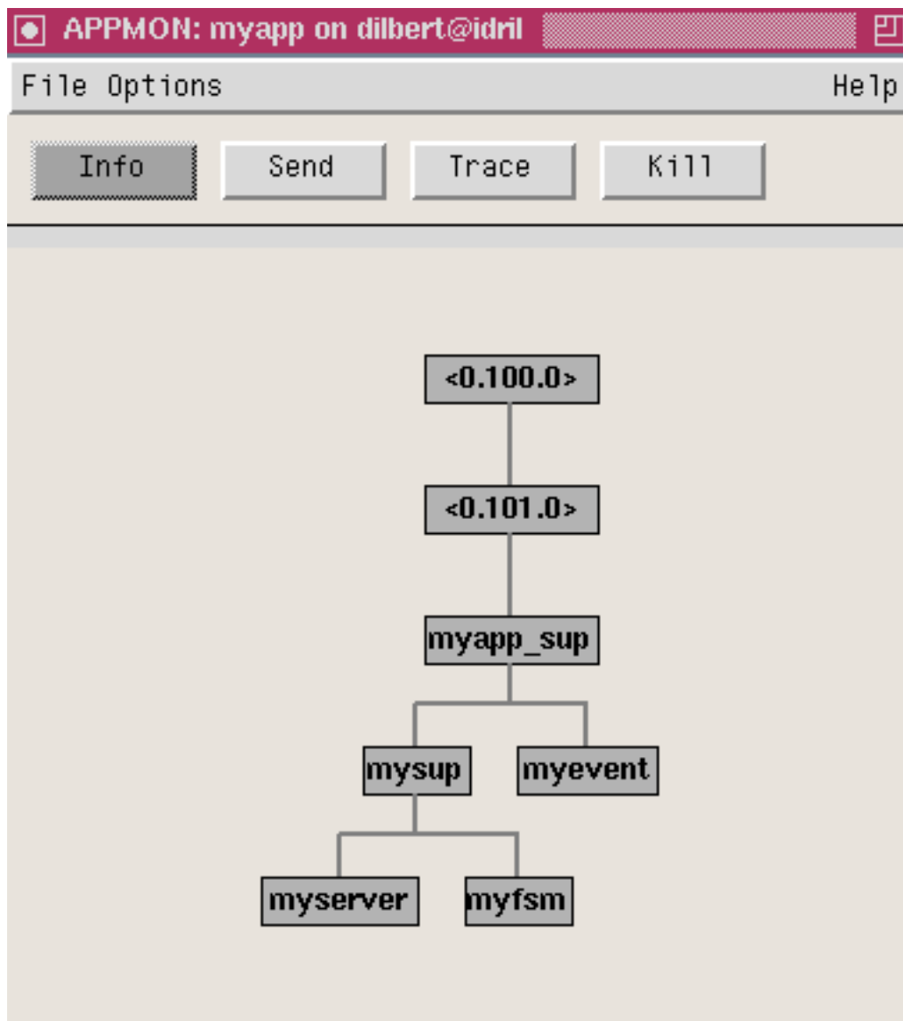
Figure 1.2: The Application Window.

The application can be shown either as a strict supervision tree, or as a process view with all linked processes. In supervision mode, the tree-gathering and -building algorithm assumes conformance to the OTP design principles.