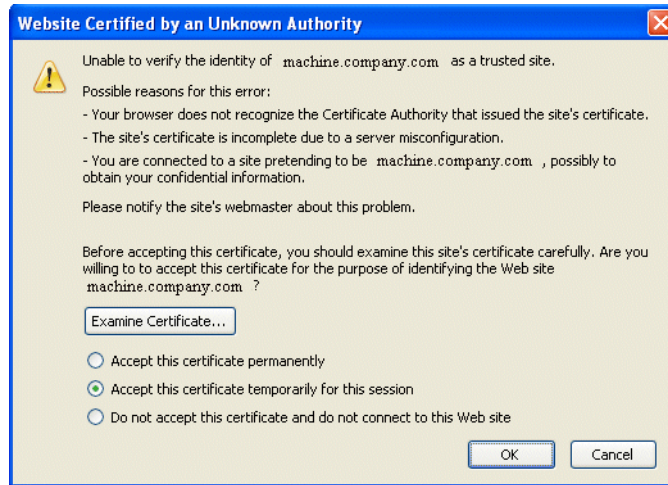
Figure 5-1 Sample Browser Response to Untrusted Certificate

Similarly, the first time asadmin receives an untrusted certificate, it displays the certificate and lets you accept it or reject it, as follows: (If you accept it, asadmin also accepts that certificate in the future.)