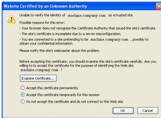
Figure 5-1 Sample Browser Response to Untrusted Certificate

Similarly, the first time asadmin receives an untrusted certificate, it displays the certificate and lets you accept it or reject it, as follows: (If you accept it, asadmin also accepts that certificate in the future.)