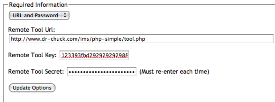
Figure B.2 Authoring screen for Basic LTI links inside of the TC.

If the TC chooses to support link-level credentials, they are supporting the ability for the Instructor to author Basic LTI links inside of the TC. The minimal authoring screen is very simple.