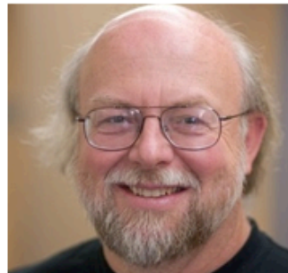
“Father of Java” James Gosling CTO, Liquid Robotics

At Liquid Robotics, our use of NetBeans IDE is all about integration. There's the seamless integration of development tools and Java technologies within NetBeans IDE, but it's also very good at integrating external features, for example, Jenkins, which we use for our build server, Git (via GitBlit), which is our source code repository, JIRA for bug tracking, Maven for running builds, and Artifactory for maintaining the artifacts created from the builds.