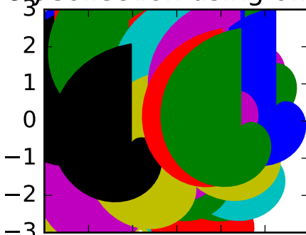
Regular PolyCollection using offsets successive data offsets