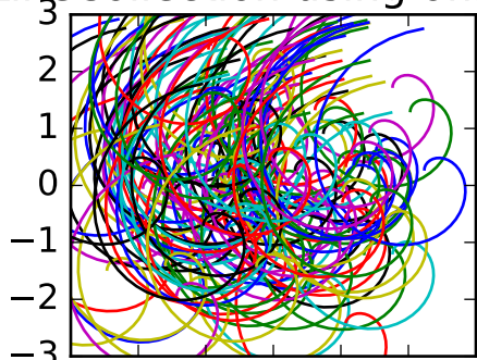
LineCollection using offsets PolyCollection using offsets