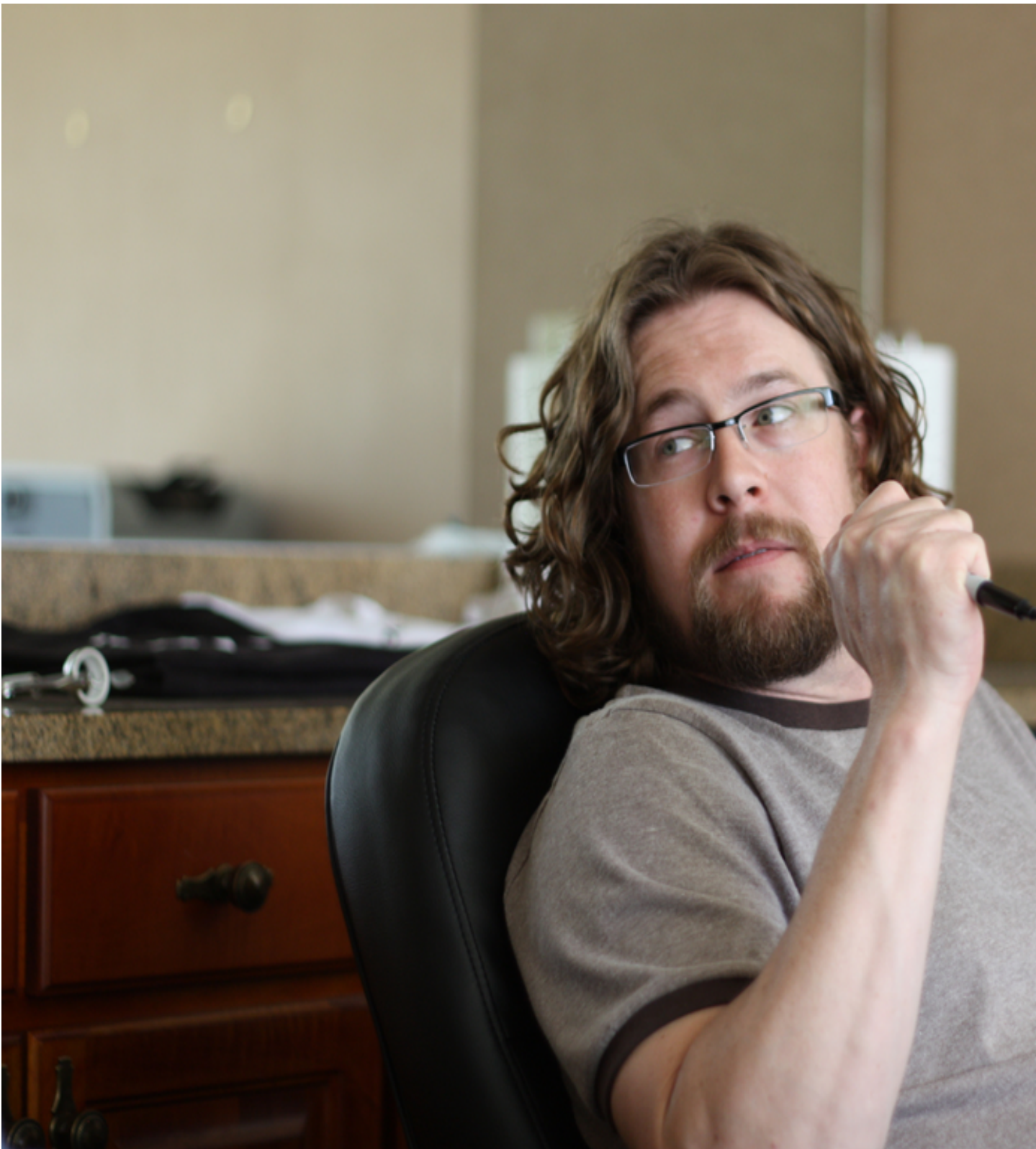
Figure 1: Mike Rylander was sent from the future to defend the open source library system world from the tyranny of MARC