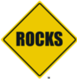
Figure A-1. Rocks™ logo

Commercial entities that wish to use any of the above names or logo in a product name or marketing material, are required to get written permission from the Technology Transfer and Intellectual Property Services Office at UCSD <invent@ucsd.edu>.